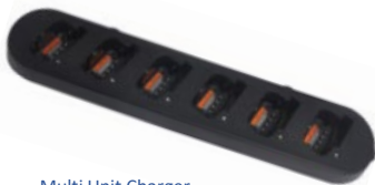
Multi Unit Charger w/ power supply