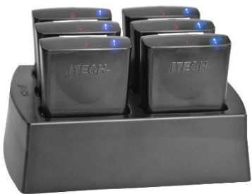
Rugged Pager Charger 6 6 position rugged pager charging base. P/N RUGCHG0100 - $