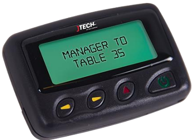
Alpha-Numeric Pager AAA Battery Operated Alpha-Numeric pager w/holder. SHIPS FROM ATLANTA ONLY P/N PGRALPHA - $