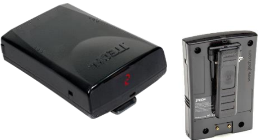
Rugged Pager w/ Rechargeable digital rugged staff pager with spring clip P/N PGRGDS2 - $