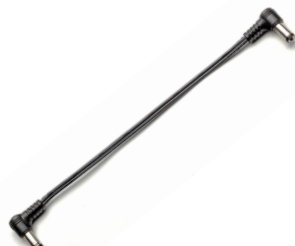
JTECH Jumper Wire Jumper wire to daisy chain any blue light pager charging bases