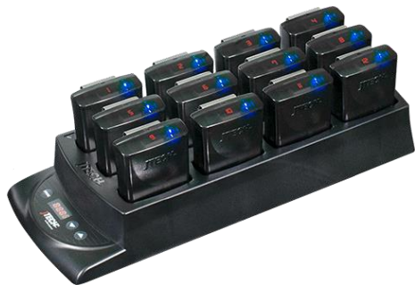
Rugged Pager Charger Auto programmable, 12 position charging base for Rugged Pager. Power supply sold separately. P/N CHRG - $