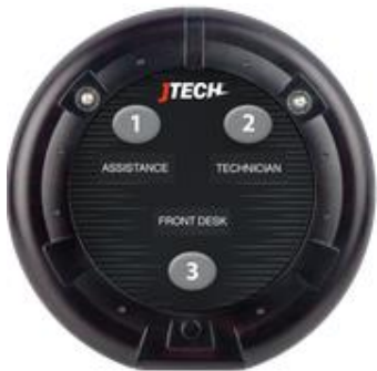
3 Button Cranberry AAA battery operated 3 buttons call button – cranberry case P/N TBLTXB3AC3 - $