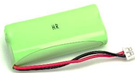
Coaster Pager FULL Replacement NiMH Full Battery Pack.