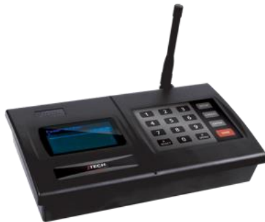
ES IStation Base EchoStream (ES) Transmitter required for any ES Call Button system. P/N TXIST - $