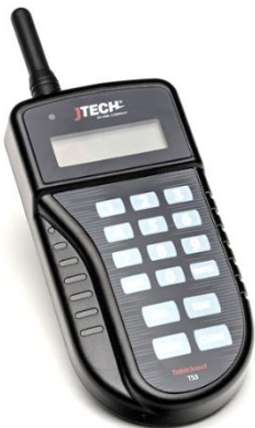
Table Scout Rechargeable handheld table status updater. P/N TS3 - $