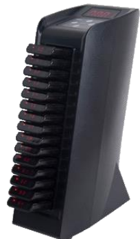
StaffCall IQ Pager Charger Auto Programmable, 15 position charging base for StaffCall IQ Pager. Power NOT included P/N STFCHAR - $