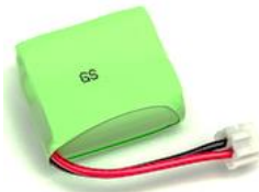
Coaster Pager HLF Battery Replacement NiMH half battery pack