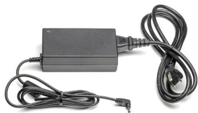
HME Charger Power Charger Power supply for all legacy HME Wireless charging – SMALL Barrel.