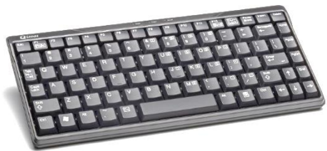
ISTATION Keyboard PS2 connected mini transmitter to be used with an Integration Station