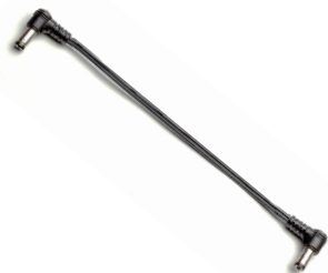
HME Jumper Wire Legacy HME Wireless jumper wire to be used to daisy chain legacy charging bases.