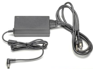
JTECH TX & Charger Power Power supply for all blue light pager charging bases and all transmitters. LARGE Barrel