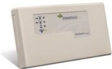
ES Repeater EchoStream (ES) repeater 900 MHz P/N REP-900-000002 - $