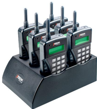
TableScout Charger 6 6 position Table Scout charging base. Power NOT included P/N CCCHAR6 - $