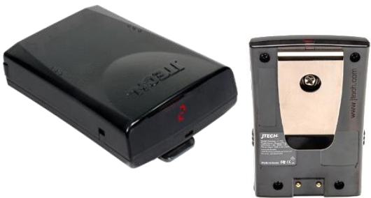
Rugged Pager w/ Metal Rechargeable digital rugged staff pager with metal clip P/N PGRGDM2 -

Unite your team for optimum guest satisfaction and productivity. Use staff and server pagers to run your business efficiently and make your services shine.