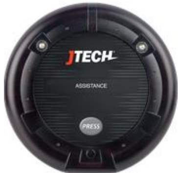
1 Button Cranberry AAA battery operated 1 button call button – cranberry case P/N TBLTXB3AC1 - $

Our push button paging systems are great for medical offices, individual and multi-provider practices including restaurants, clinics, dental care, eye care, retail, grocery stores, manufacturing facilities, church and school classrooms, stadiums, arenas and more.