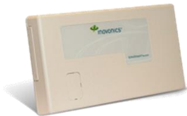
ES Serial Receiver EchoStream (ES) Receiver 900 MHz P/N REC-900-000002 - $