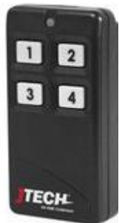
ES 4 Button Call Button EchoStream (ES) 900 MHz wireless 4 button call button P/N BUT-900-4KEYES - $