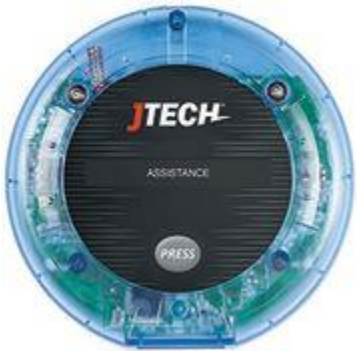
1 Button Blue CallButton AAA battery operated 1 button call button – blue case P/N TBLTXB3AB1 - $