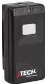
ES 1 Button Call Button EchoStream (ES) 900 MHz wireless 1 button call button P/N BUT-900-1KEYES - $