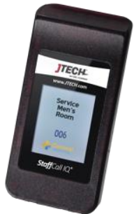
StaffCall IQ Pager Rechargeable StaffCall IQ Digital Pager with color screen. LI-ION P/N STFIQ - $