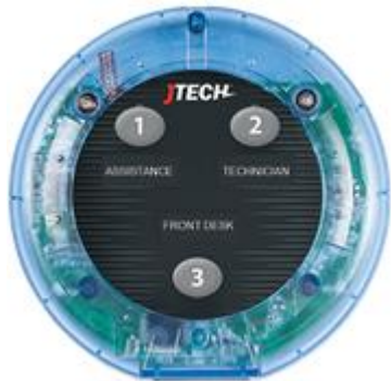
3 Button Blue CallButton AAA battery operated 3 buttons call button – blue case P/N TBLTXB3AB3 - $