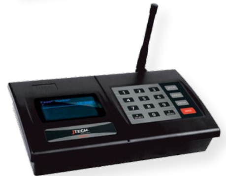
IStation Integrated Transmitter