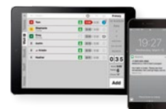
Waitlist & Messenger